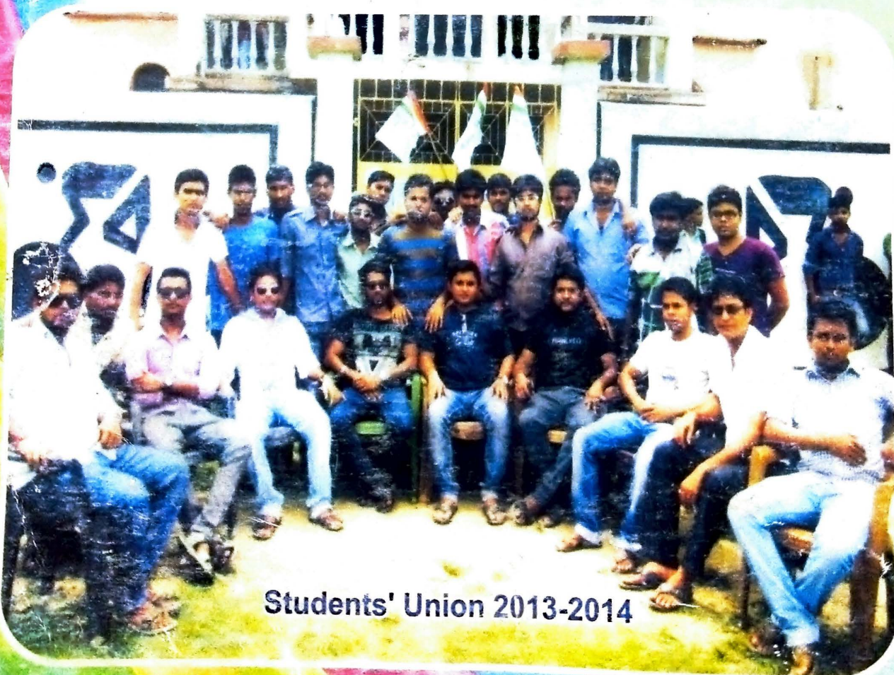
Students' Union 2013-2014