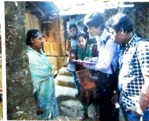
Survey by Geography Students