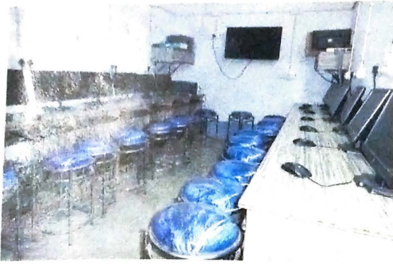
Computer Lab, Dept of Geography