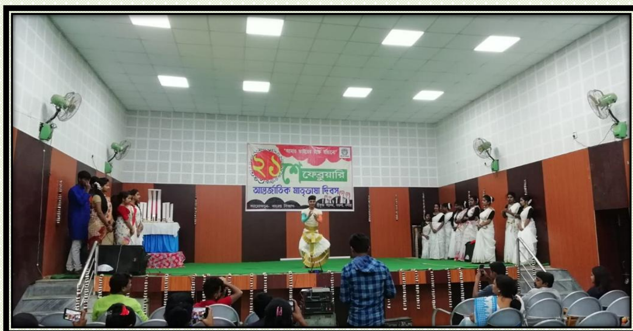
i) Photo of Auditorium

Renovation work of Auditorium has completed at the end of 2019 and it has inaugurated in the month of January of 2020. Air-conditioned auditorium having seating capacity of 280 with a large stage, two green rooms, good seating arrangement and separate washroom for ladies and Gents are there. All the cultural activities and seminar are arranged in this auditorium.