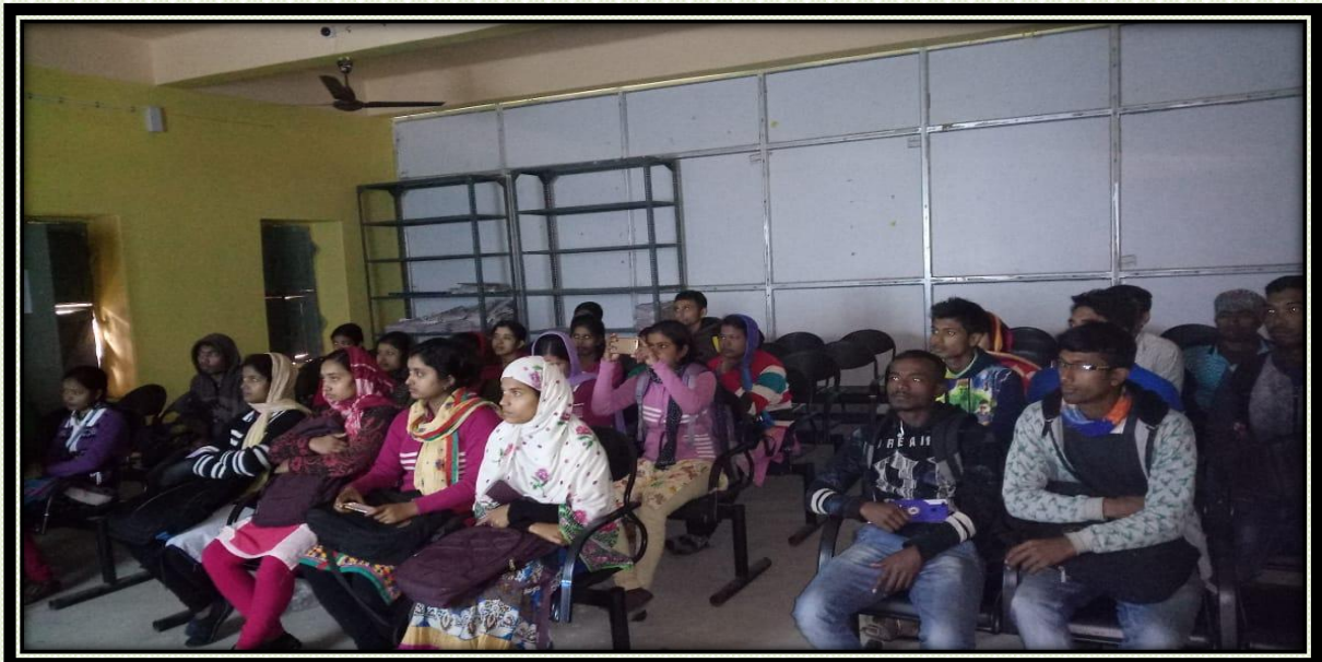
a) Photo of Class Room

Srikrishna College has 31 class rooms for taking theoretical classes and 19 laboratories to explore experimental learning. Each of these rooms is equipped with black as well as white boards, adequate desks and benches. All the class rooms of main building are Wi-Fi enabled. Sometimes classes are conducted in laboratories also due to the insufficient number of class room.