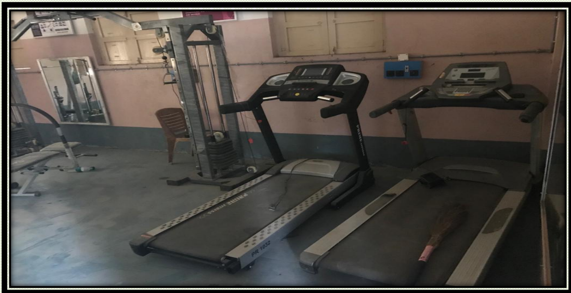
k) Photo of Gymnasium Room