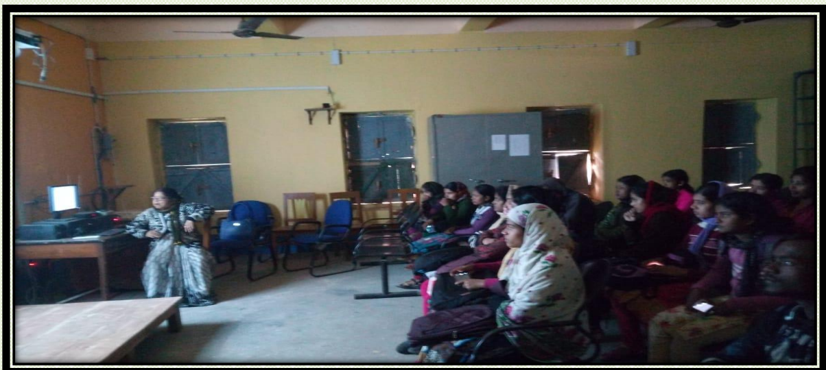
b) Photo of Class Room