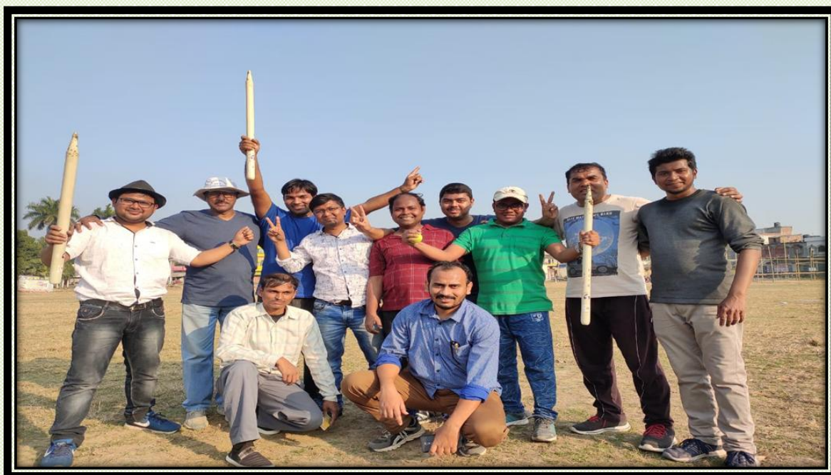
j) Photo of College Playground

Regarding sports facilities are concerned; a large playground in front of the college is used for college sports and other cultural activities. College playground is also allowed to use by local schools or other social organization for organizing annual sports, competition and fairs. One Basketball Court is made in front of the main building of the college. Large number of Students have participated and won gold and silver medals in university, state and in national level games. Their performance in international level sport meet is equally commendable. One of our students won silver medal in international (SAG) in 2018-19 and another student participated in international Kho-Kho event in the year 2018-19. Sports facilities are made available for all the students. Physical Education Department always looks after the up-gradation and improvement of sports facilities.