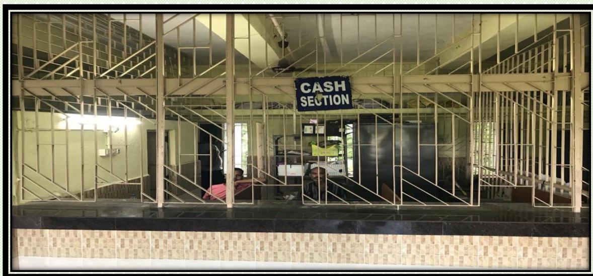
f) Photo of Cash Section Office