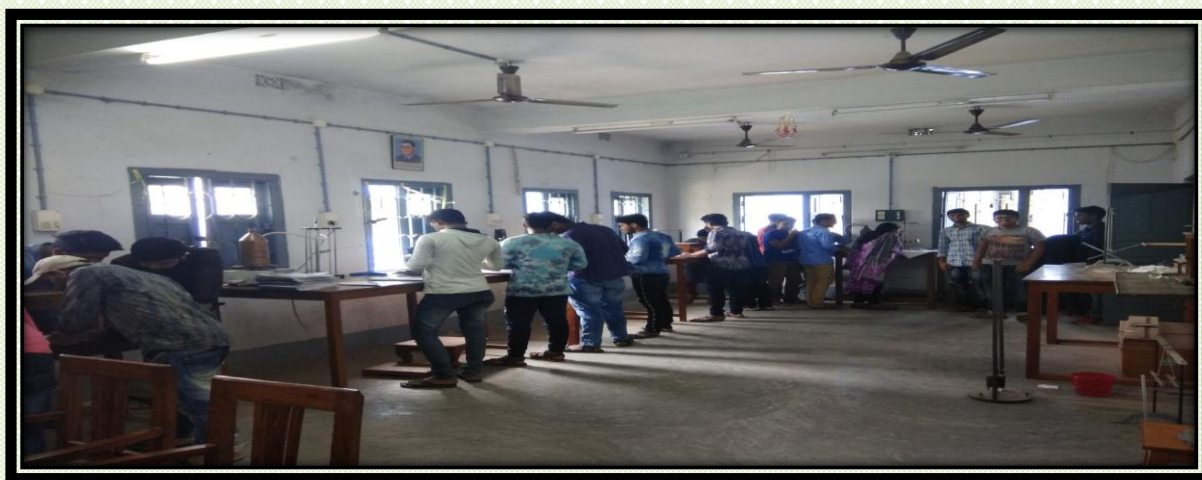
c) Photo of Physics Laboratory

At present Srikrishna college has 19 laboratories for the lab-based department: Physics, Chemistry, Mathematics, Computer Science, Geography and Commerce to explore temper and spirit of enquiry among the students. Computer Science department has two laboratories: One Software lab and one Hardware lab. Both the laboratories are air-conditioned. Both Physics and Chemistry department have five laboratories each as a part of the curriculum. All the laboratories are well equipped with the latest instruments and apparatus to facilitate all the students of Honours and general course to do their experimental learning. Laboratory rooms are large enough for air circulation and free movement of the students. All the laboratories are well maintained and upgraded time to time.