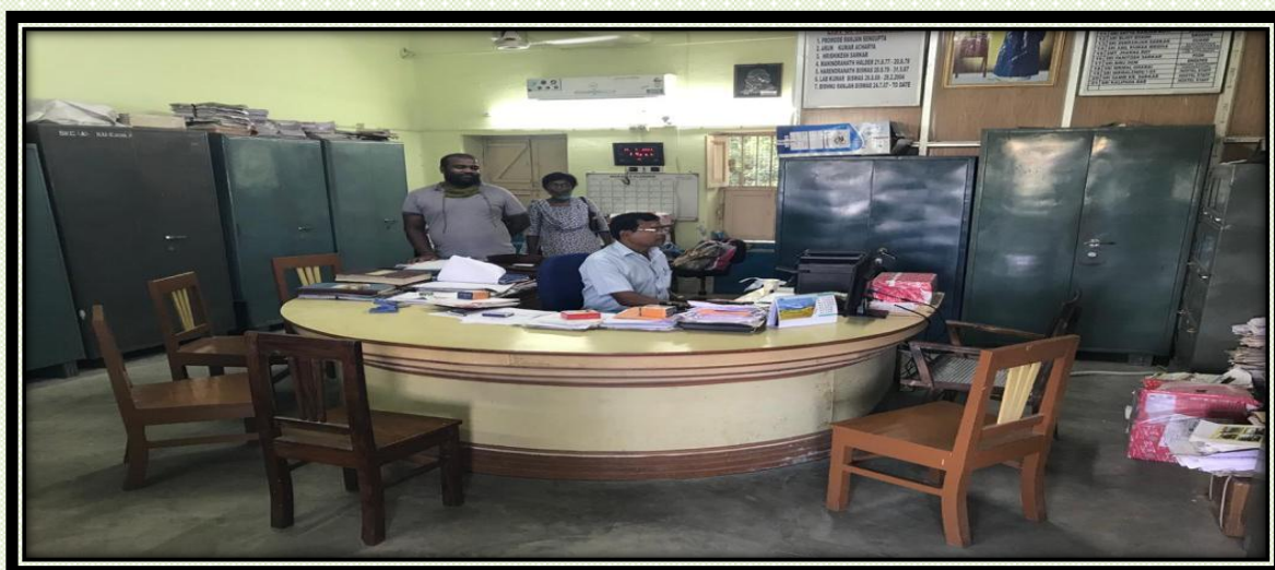
e) Photo of Head Clerk Office

In the academic session 2018-19 Science departments like Chemistry, Computer science and Mathematics are sifted to the newly constructed Science Block FB V. Vertical Extension work of FB IV has already been completed.