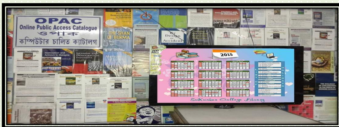
h) Photo of College Library